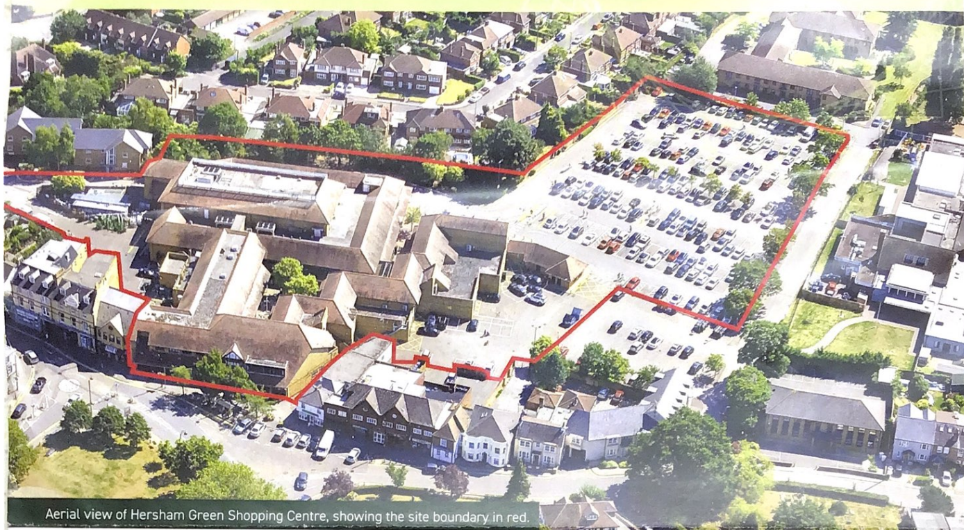
Aerial view of Hersham Green Shopping Centre, showing the site boundary in red.

Last year, we shared our initial ideas for how we could invest in and improve Hersham Green Shopping Centre. We were pleased with the level of interest from the local community and would like to thank everyone who participated in our events and provided their feedback.