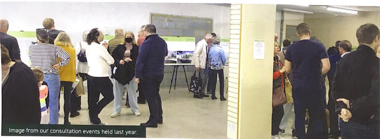
Image from our consultation events held last year.

The revised scheme proposes less homes, with fewer residential blocks and more space between the buildings. The buildings themselves have been designed to further reduce the impact on neighbouring properties.